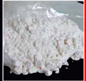
Silex® Premium waffle mix