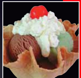
Ice cream basket (made in basket shaper)