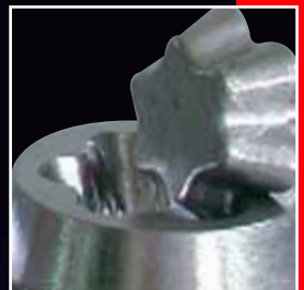
Waffle accessories, full aluminium casting, ball polished