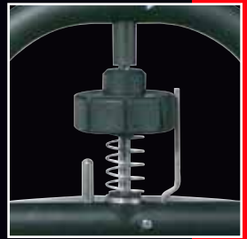
Adjust your exact dosage quantity