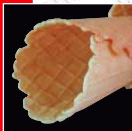
SILEX ® Ice-cream cone