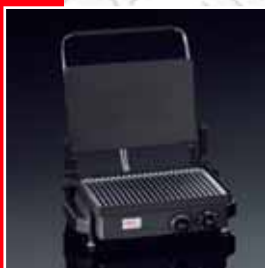
With roasting griddle