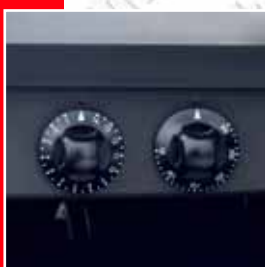
Time and temperature regulation

Upper hood made of highest grade stainless steel, easy to clean