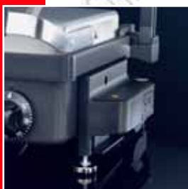
Height adjustable feet