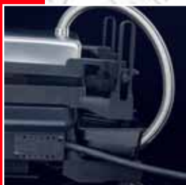
Self adjusting height of top plate