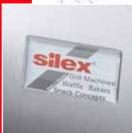
Brushed stainless steel