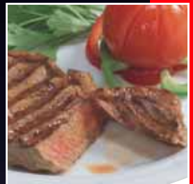
Quality preserving and energy saving grilling technology