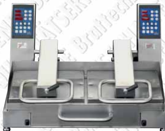
S-261 GR Double with one continuous Duranel®- plate below, 2 single plates at the top and weight reduction (GR)