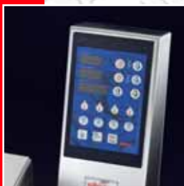
Large display simple visibility