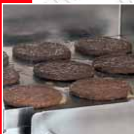
High volume output energy saving