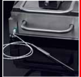
Core temperature sensor (optional)