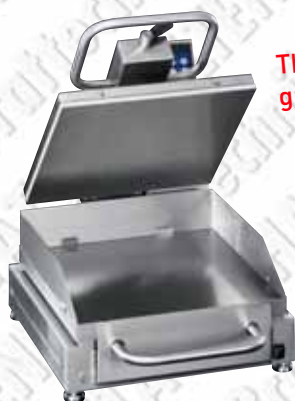
S-161 GR with Duranel® plates and weight reduction (GR)