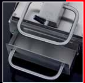
Grease collection tray