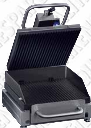
S-165 GR Both sides cast iron with grooved plates and weight reduction function (GR)

The fastest meat/food grilling machine in its field!