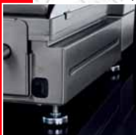
4 height adjustable feet