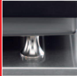
More height for better cleaning