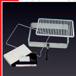
Accessories and video included

Available in 3 versions with cast-aluminium plates: T-Klasse 10.10: flat / flat T-Klasse : grooved / grooved T-Klasse : grooved /flat