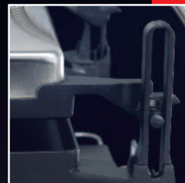
Self adjusting height of top plate