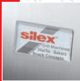
Brushed stainless steel