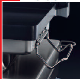
Sandwich spacer wings