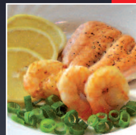
Quality preserving and energy saving grilling technology